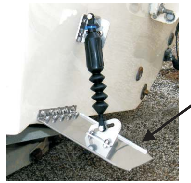
SMART TABS plates in the RUNNING POSITION

Follow the instructions on Page 6 of the installation manual and substitute the PR500 Bracket for the standard Transom